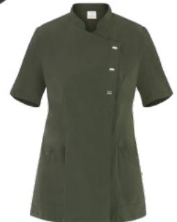
102 Military green