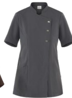
119 Medium grey